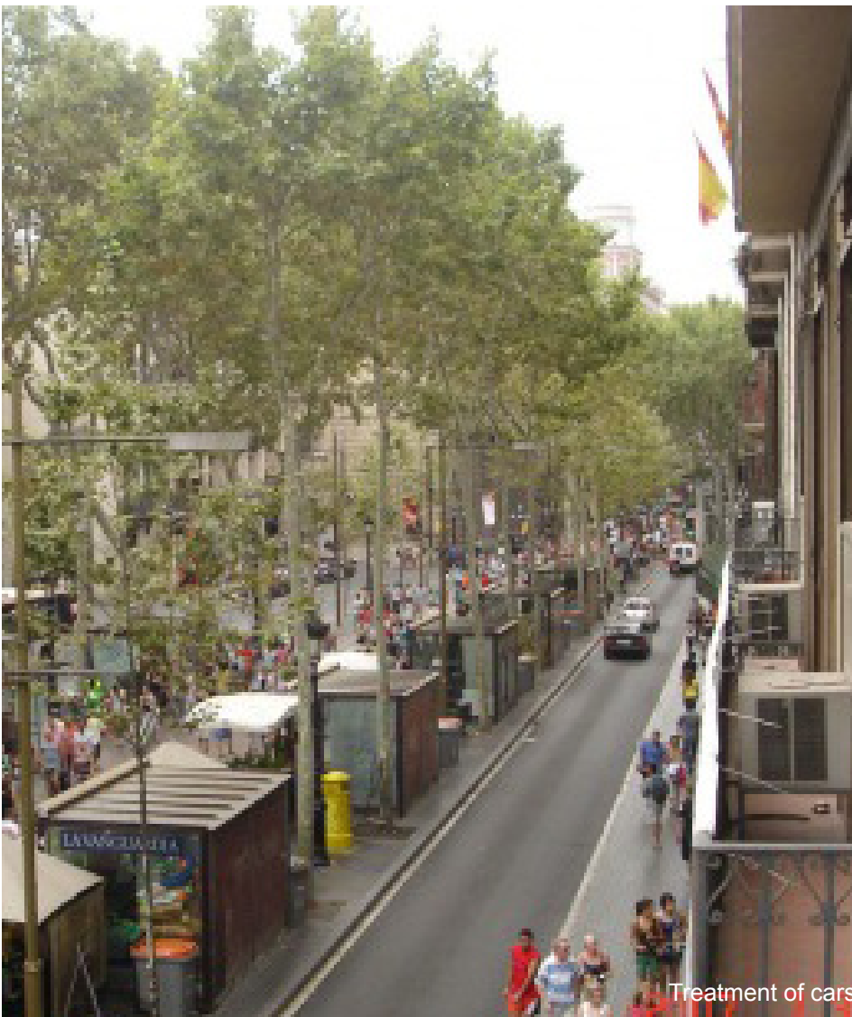
Treatment of cars

Las Ramblas is set in Barcelona, Spain. It stretches about 1.5 kilometers long, running through the middle of the city on a former riverbed, and divides the Gothic area from El Raval, a working class district. During Roman and early medieval times, a wall there marked the city limits, and the stream acted as both a moat and a sewer that would occasionally flood. Until the beginning of the 18th century, Las Ramblas was a path along this stream, running between convents on one side and old city walls on the other. In the 1700s, houses were beginning to be put up at the site of some of the old city walls and trees began to be planted. In 1775, the old city walls by the Drassanes medieval shipyard were demolished, and by the end of the 18th century, the street began to be systematically developed into a kind of tree-lined avenue; it began to closely resemble the promenade there today. Its name comes from the Arabic word "ramla," which means "sandy ground."