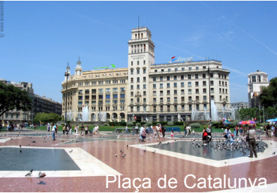
Plaça de Catalunya

The upper end of Las Ramblas runs into the Plaça de Catalunya, which is a large square that is generally considered to be Barcelona's city center. Several busy streets in Barcelona meet at this busy square and along the street that also acts as a transportation hub. There are three Metro stops that connect to Las Ramblas. Streets that meet Las Ramblas connect to important districts and destinations such as art and cultural institutions, the offices of the Municipal District Council, and important shopping streets. Las Ramblas is a street that has six sections, each with a different name. From north to south, these sections are: