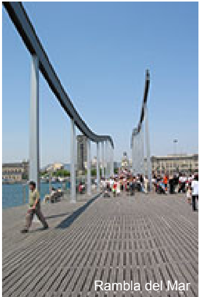
Rambla del Mar